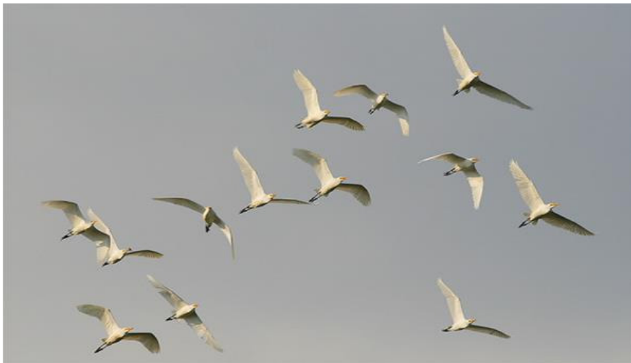
ABOVE: Cattle Egrets

Are you a bird watcher? Get ready for the migrations of birds such as cattle egrets as they journey between the United States and Canada. This natural cycle is part of our beautiful ecosystem.