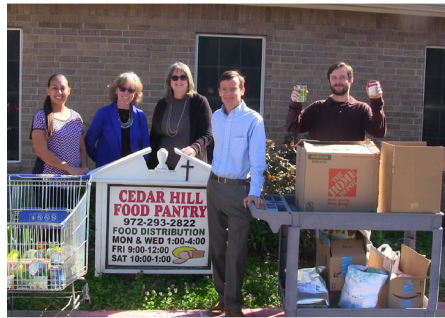
ABOVE: Zula B. Wylie Public Library staff dropping off the items donated.

During the month of January 2017 the Zula B. Wylie Public Library offered a fine forgiveness program. Individuals were asked to bring one non-perishable food item or canned good with late fees. The Food for Fines program cleared fines on participant's accounts while helping the Cedar Hill Food Pantry. Library staff delivered approximately 300 food items to the Cedar Hill Food Pantry this year.