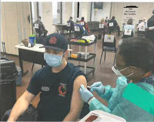
Cedar Hill EMS teams receive the coronavirus vaccine in January. Residents can register to be vaccinated with Dallas County at dallascounty.org/covid-19 .

The pandemic has pushed many programs, services, and daily interactions online. For those that need help getting connected, the Zula B. Wylie Public Library (225 Cedar Street) has started a new program to provide basic technology assistance. Stop by on Tuesdays from 2 to 4 p.m. or sign up for an appointment at cedarhilltx.com/techhelp .