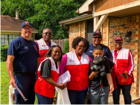
The Cedar Hill Fire Department, together with the American Red Cross, replaced 530 smoke detectors in Cedar Hill Neighborhoods in May.

As summer heats up, demand for water increases. Use less water and lower your utility bill with these water-saving tips: