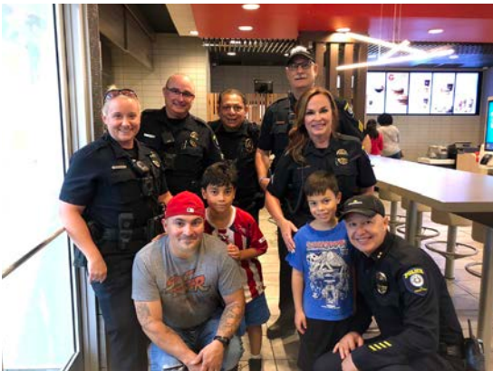
Cedar Hill Police Officers hosted 'Coffee with a Cop' to get to know residents and build relationships.

Mulch conserves moisture by reducing evaporation of water vapor from the soil surface. Mulching also prevents compaction, reduces disease, and prevents weeds.