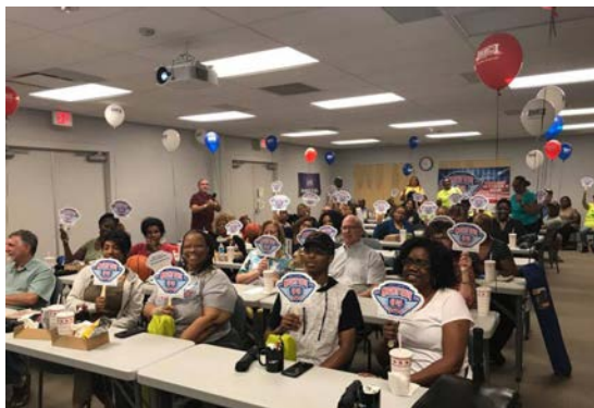
Neighborhood leaders kick off planning efforts for National Night Out, one of the community's award-winning annual neighborhood engagement events held the first Tuesday in October.