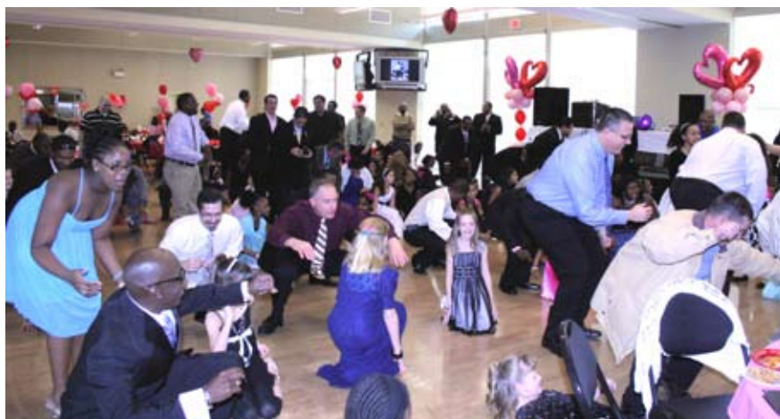
Dads & daughters had a blast "getting down" at the Daddy/Daughter Dance

This year's Mother/Son "All Star" Dance is set for May 1. Visit cedarhilltx.com for more information about this and other upcoming events at the Cedar Hill Recreation Center.